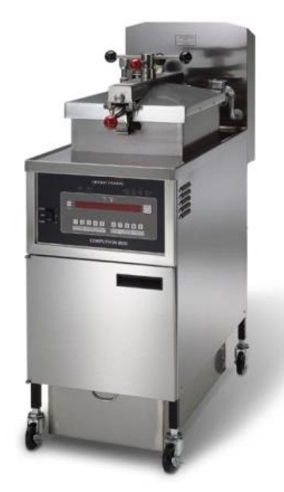
PFG 600 gas pressure fryer with Computron™ 8000 control

Henny Penny first introduced commercial pressure frying to the foodservice industry more than 50 years ago. Frying under pressure enables lower cooking temperatures for longer oil life, and faster cooking times to meet peak demand. Pressure also seals in food's natural juices and reduces the amount of oil absorbed into product.